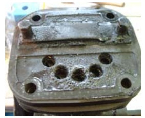
Carbon build up on valve plate

Look for any sign of leakage around the cylinder head and valve plate, particularly the gaskets. Replace any damaged gaskets. If you consider that the compressor is slow to charge the air system then there may be carbon blocking the cylinder head and/or delivery pipe (see point 6). If this is the case remove the cylinder head and valve plate and check for the presence of carbon. If there is significant carbon present then the compressor should be replaced as it is difficult to effectively remove these carbon deposits. It is important that the condition of the delivery pipe is checked (see point 6).