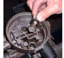
Carbon build up in an air dryer

Blockage of the compressor delivery pipe can lead to slow charging of the air systems, high compressor duty cycle and overheating of the air compressor leading to more carbon being generated. Blockages in the pipe will be worse at bends and so may be difficult to see. Blowing shop air down a delivery pipe is not an effective way of determining if the pipe is blocked. If in doubt, and particularly if carbon has been found in the cylinder head, replace the delivery pipe as chemical cleaning of the pipe is rarely satisfactory. If the delivery pipe is found to be blocked then there is a chance that there are carbon deposits in the air dryer – strip down and check.