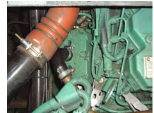
Check there is no damage or crushing of the compressor inlet pipe

Check the pipework of the compressor inlet system for any blockage or damage. Correct any problems found. Any restriction in the compressor inlet pipework can lead to a potential increase in oil carry over from the compressor. Any holes or splits in the pipework can lead to contaminated air being sucked into the compressor leading to premature wear. If the compressor uses a separate inlet filter then check the condition of this filter.