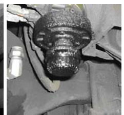
Exhaust with oil present

to establish if any oil has reached these. If it has they will need to be serviced or replaced to maintain correct function of the braking system. Be sure to drain any oil and water from the air reservoirs. Page 1 of 2