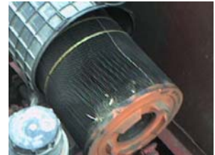
Check the condition of the engine air filter

If the compressor takes its air from the engine intake system, in particular check the condition of the engine induction (intake air) filter. Check also the pipework of the engine induction system and correct any blockage or damage. Problems with the engine induction system can lead to excessive depression (vacuum) at the engine intake and at the compressor inlet leading to a potential increase in oil carry over from the compressor.